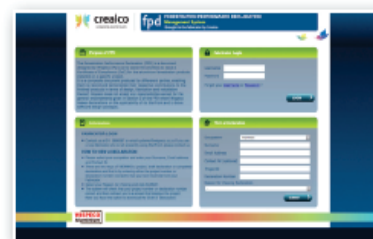
FPD online platform landing page